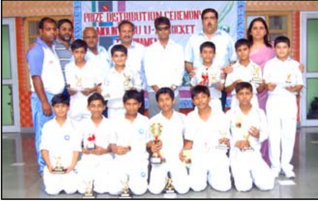
Winners in Different Categories at the Prize Distribution Ceremony of Fifth Cricket Tournament organised by Mount Abu Public School, Rohini

International thus letting it secure the 1st runners up position and Sachdeva School,