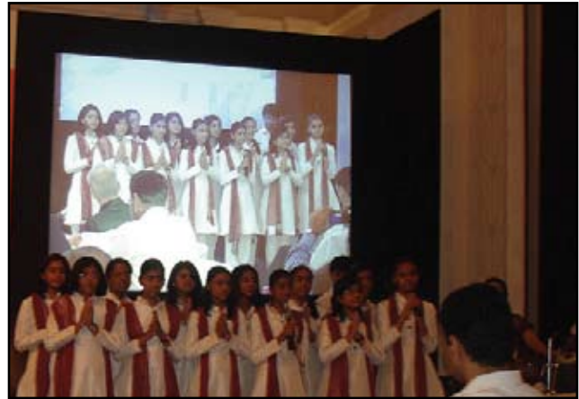
Choir from a CBSE School rendering Saraswati Vandana at the Launch of PEC Resources