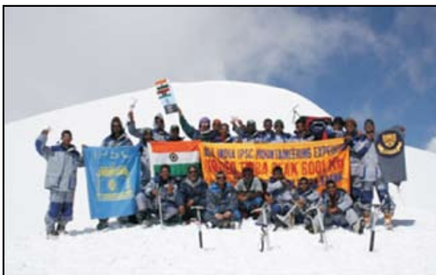
A Composite Team from Six Sainik Schools at the summit of DEO Tibba Peak in Himachal Pradesh