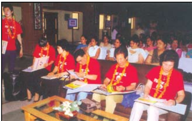
Korean Delegates attending Sports and Mind International Workshop on Health and Physical Fitness at Kulachi Hansraj Model School, Delhi

Kulachi Hansraj Model School, Ashok Vihar hosted a workshop on learning