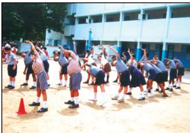
Children performing a suggested Sport activity at a Pilot Workshop at Chinmaya School, Chennai

CBSE in collaboration with British Council under the auspices of – Ministry of Human Resource Development has launched a Physical Education Programme as a part of “International Inspirations” which took off in a three day exciting workshop at Chinmaya Vidyalaya, Taylors Road Chennai. The CBSE as part of its Comprehensive School Health Programme, that was launched two years back, advocated for regular inclusion of physical fitness activities in school on daily basis. These would translate into adequate health benefits for the children and teachers as well. Physical fitness happens to be one of the six themes of the School