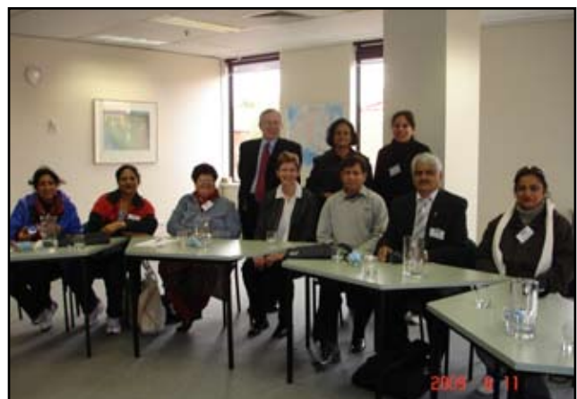
Indian Delegation in Australia under the Principal's Exchange Programme to Australia

Next on the itinerary was a visit to Gene Technology Center in Melbourne, a select entry school, which provides guidance and assistance to research scholars.